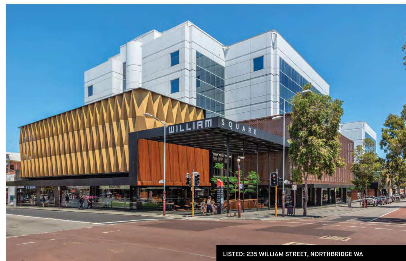
LISTED: 235 WILLIAM STREET, NORTHBRIDGE WA