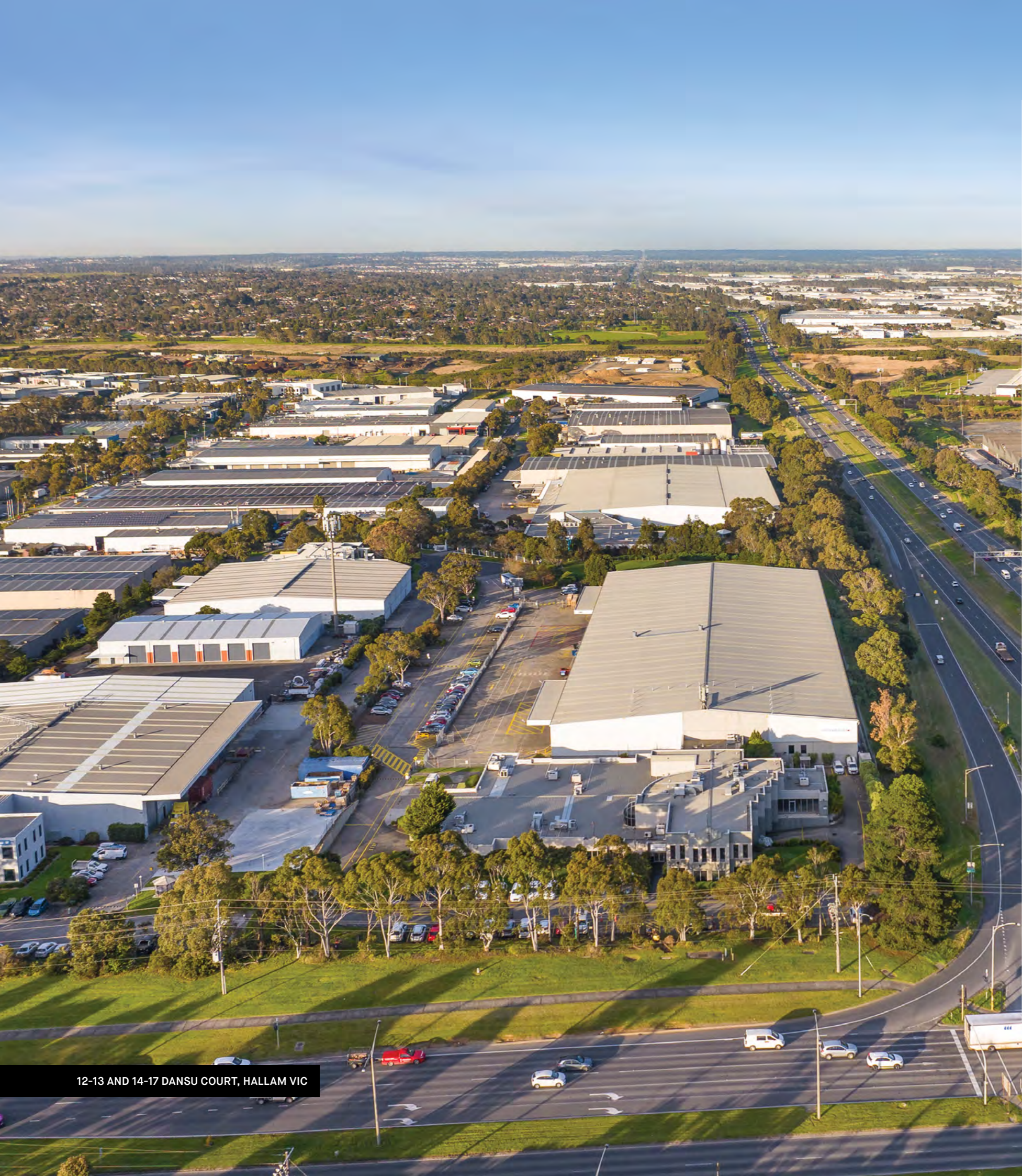
12-13 AND 14-17 DANSU COURT, HALLAM VIC