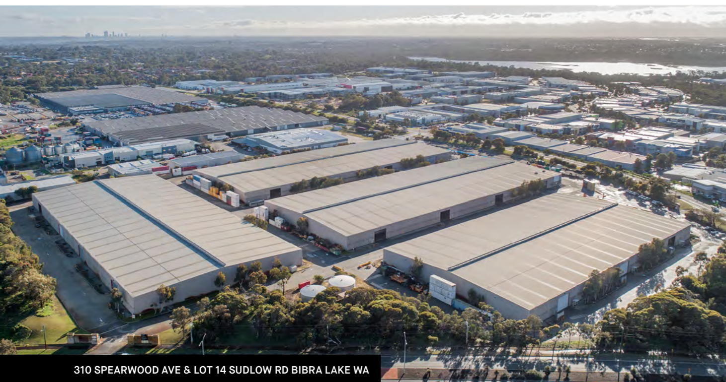
310 SPEARWOOD AVE & LOT 14 SUDLOW RD BIBRA LAKE WA

In addition to the skills and experience set out on the next page, the Board comprises Directors with diverse backgrounds, and an appropriate balance of Directors with strong corporate memory and those that bring an external or fresh perspective.