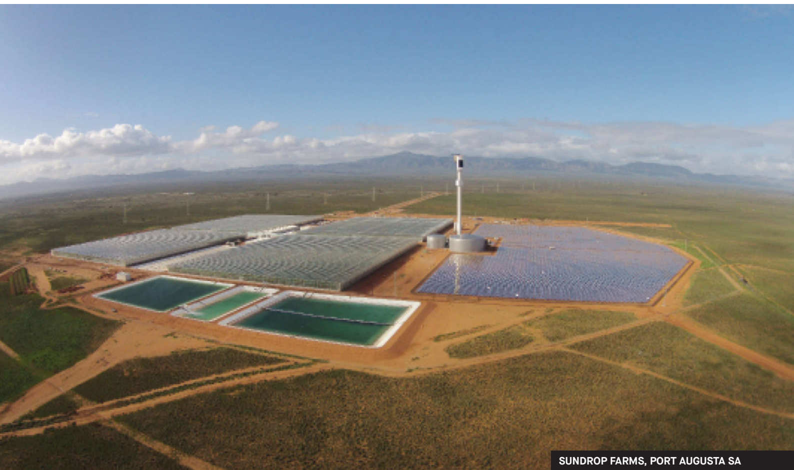
SUNDROP FARMS, PORT AUGUSTA SA

Centuria Property Funds Limited ABN 11 086 553 639 AFSL 231149 | centuria.com.au | contactus@centuria.com.au | +61 2 8923 8923